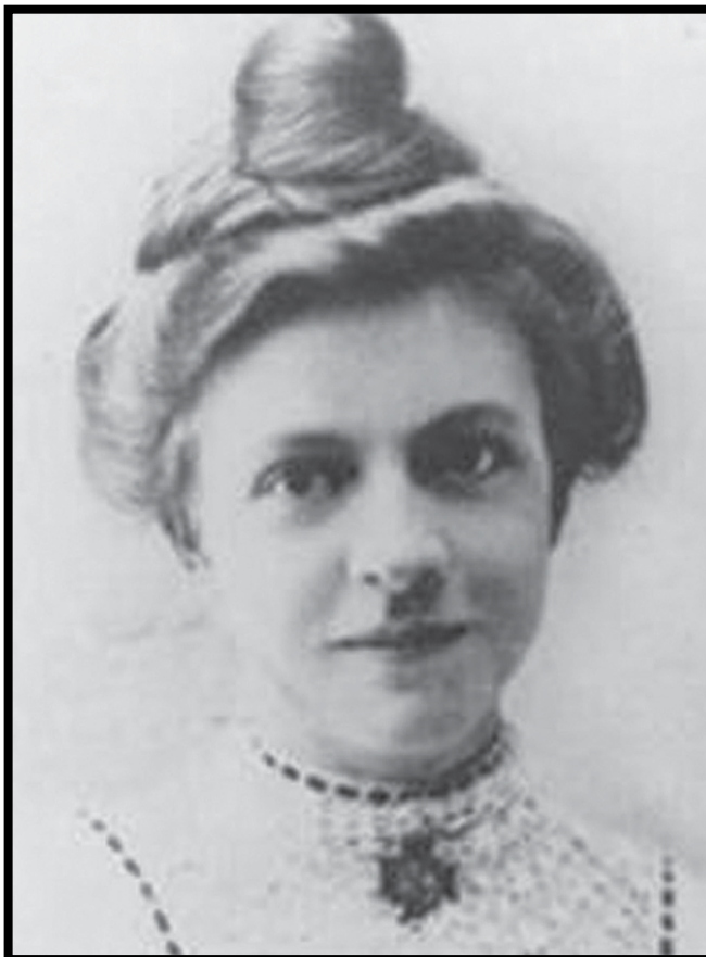
Figure 1: Clara Maass portrait, circa 1898.