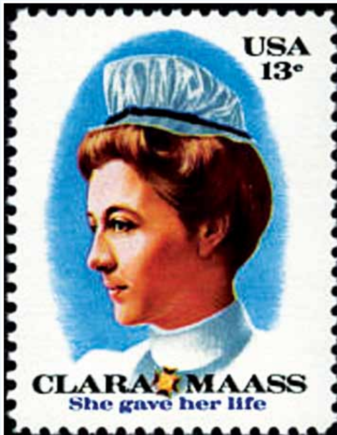
Figure 2: Clara Maass commemorative stamp, 1976.

The hypothesis that the bite of an insect or other arthropod could somehow cause illness or death to human beings has been around for some time. This theory was put forth by several individuals during the second half of the 19th century, although it had been mentioned, perhaps cryptically, in some earlier writings.